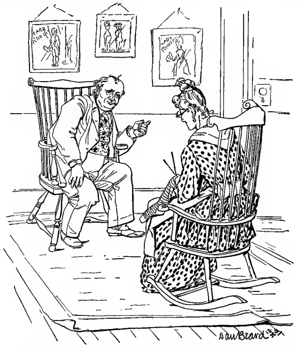
"IT MUST TRY YOUR PATIENCE PRETTY SHARPLY SOMETIMES."

ples and idiots and stray cats and all the different kinds of poor wrecks that other people don't want and he does , and then when the poverty comes again I've got to clear the most of them out or we'd starve; and that distresses him, and me the same, of course.